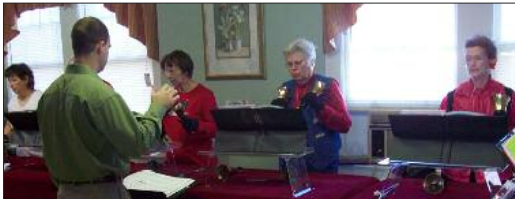
The Main Street United Methodist Church handbell choir gave a concert for residents. It was lovely.