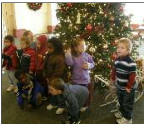
Children from the Big Island Head Start visited to sing and to see our decorations. We always enjoy their visits.