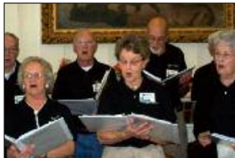
The Silver Notes make beautiful music. They sang a variety of familiar tunes.