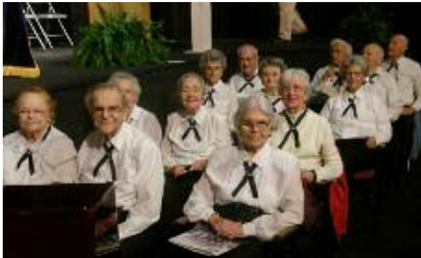
The Elks Home Chorus at the memorial service