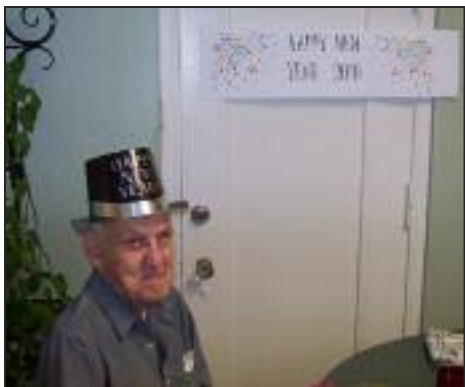
Kit is enjoying the New Year's party in Special Care.